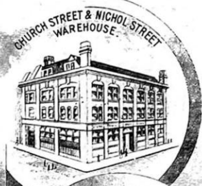
CHURCH STREET & NICHOL STREET WAREHOUSE.