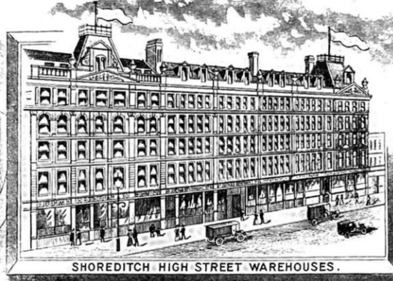
SHOREDITCH HIGH STREET WAREHOUSES.