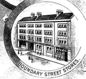
BOUNDARY STREET STORES.